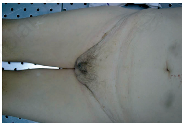
Figure 3. Hypogonadism and micropenis of the man.