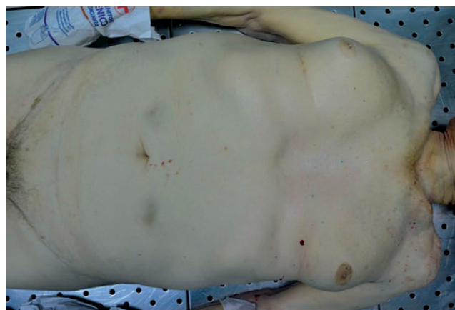
Figure 2. Gynecomastia of the man.

the detection of small testes associated with tall stature. In this case, a DNA test was performed in order to confirm the genetic abnormality. By pathological examination were observed sclerotic tubules and hyaline, with the presence of germ cells and sperm.